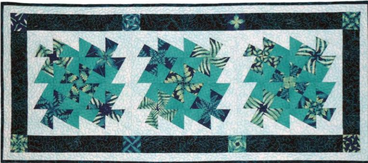
Runner 18" x 42"