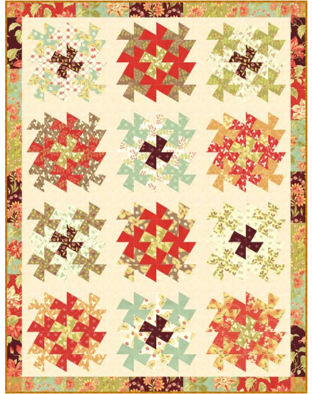
One Background Version

See separate class cutting instructions sheet to cut fabrics (except the large print fabric if making Kaleidoscope version we will be cut in class) into squares and strips before class so we can start sewing right away in class.