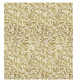
(D) & (J)