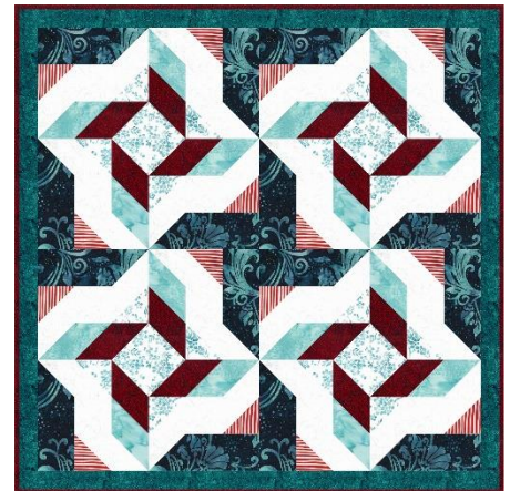
Topper 26" x 26" – Layout 3