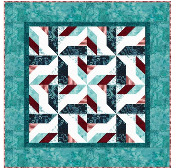
Topper 34" x 34" – Layout 4