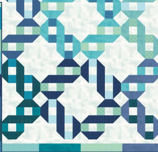
Rings Layout (Twin 66" x 86")