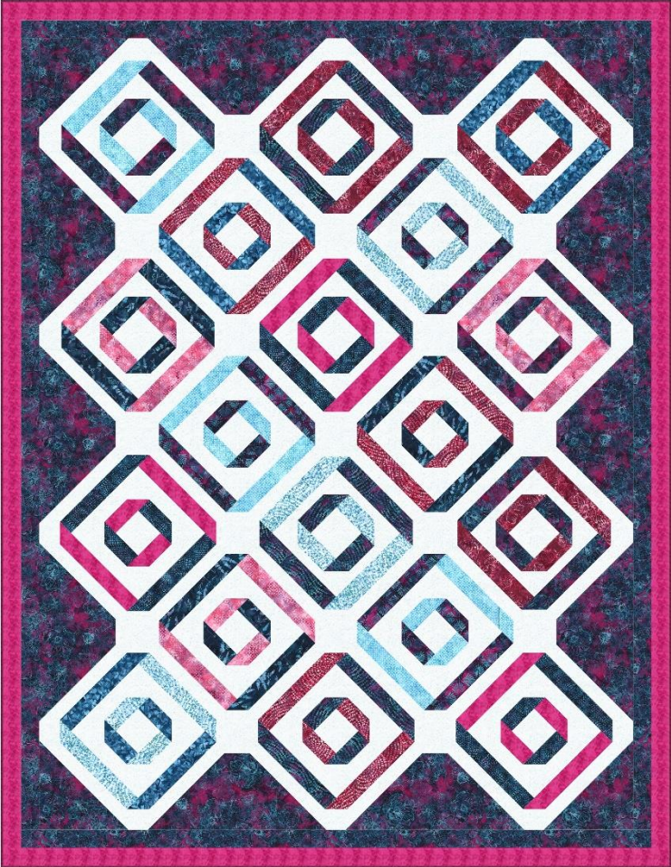
74" x 96" Twin

Play with combining strips into pleasing pairs or grab strips randomly to create chance encounters!